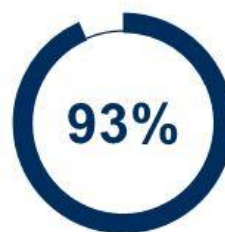
Year to Date (2019)