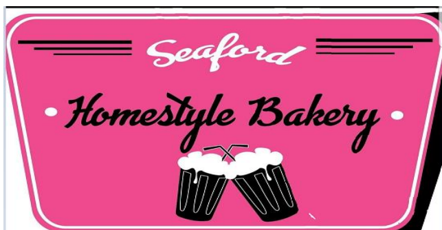
Seaford Homestyle Bakery Roadhouse.