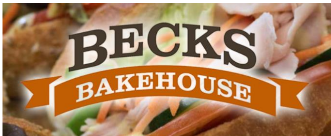
Beck's Bakehouse Port Noarlunga.

We would like to extend our appreciation to local businesses who have been supporting the school community through regular generous donations.